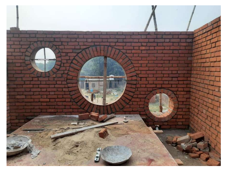
This will be the view from this classroom . . . quite different from most of the other rooms with their long slit windows.