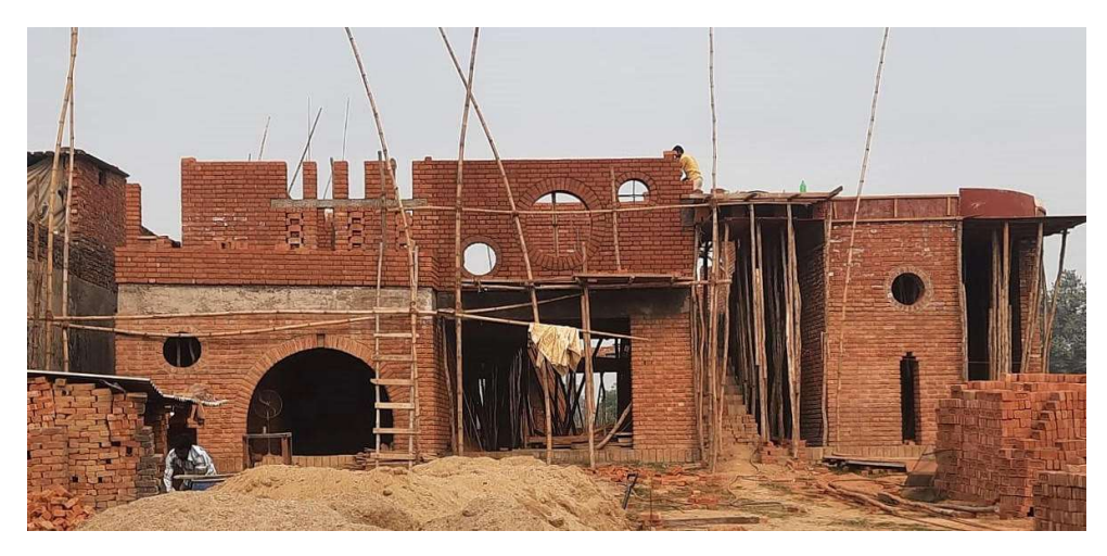
And here's the new front view. The second floor is now complete except for the roof which will be poured in a few days. The tall space to the right of the 3-round-window wall will be the stairwell.

It's exciting to see the architectural plans come to life! The villagers are also excited as they see the building grow.